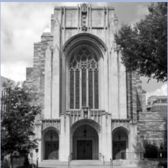
The First Baptist Church of the City of Washington, D.C.